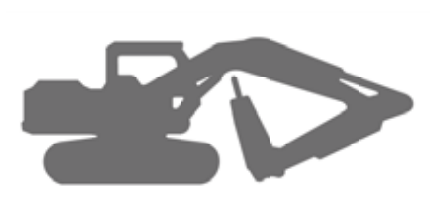
Excavator 20 metric tonne / 44,100 lb

The BXR Series uses recoil sensing technology with operator actuated two-speed control and an oversized piston. This combination maximizes blow energy and bpm's under varying rock conditions. For example, in hard rock conditions, the bpm's are increased providing up to 80% operating efficiency versus 50% efficiency of a conventional breaker: